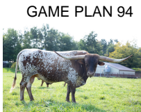
GAME PLAN 94