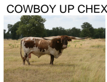
COWBOY UP CHEX