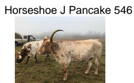
Horseshoe J Pancake 546