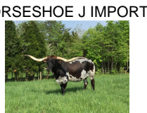
HORSESHOE J IMPORTANT