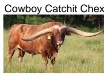
Cowboy Catchit Chex