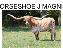
HORSESHOE J MAGNIFY