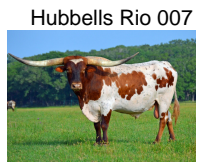
Hubbells Rio 007