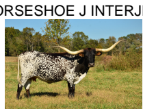
HORSESHOE J INTERJECT