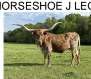
HORSESHOE J LEGIBLE