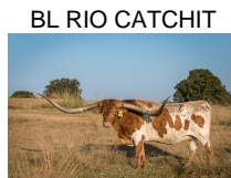
BL RIO CATCHIT