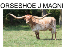
HORSESHOE J MAGNIFY