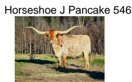
Horseshoe J Pancake 546