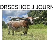
HORSESHOE J JOURNEY