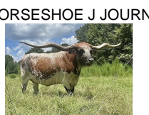
HORSESHOE J JOURNEY