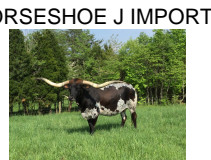
HORSESHOE J IMPORTANT